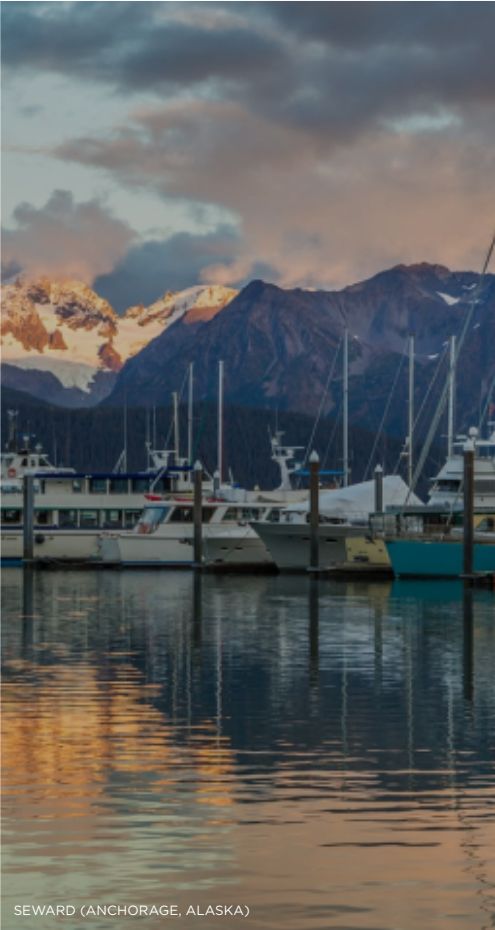
SEWARD (ANCHORAGE, ALASKA)