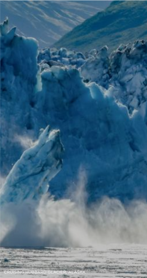
CRUISING HUBBARD GLACIER, ALASKA